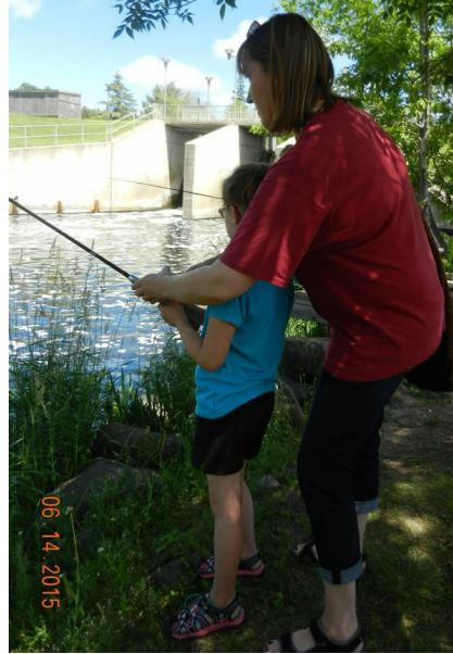
Summer 2015 fishing on the Yellow River next to the hatchery.

We're a non-profit, so your membership fee is tax deductible